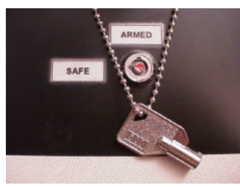
Figure 5 Removable Key Lockset

ton and launch button were pushed simultaneously, electricity would bypass the arming circuits and send full voltage to the igniter, prematurely firing the rocket motor -- not an ideal situation.