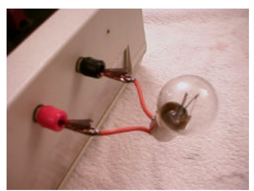
Figure 8 Light Continuity Tester

This is a far cry from the Estes<sup>™</sup> Electron-Beam<sup>®</sup> controller yet, because of its strait-forward design and safety features, I feel more comfortable letting a child sit down to operate my launch controller than the Estes. With a car brake lightbulb (Figure 8) soldered to clips and inserted in place of the launch wiring, I can explain the operation of the controller in a minute, showing the entire sequence of arming, countdown, and simulated launch (lightbulb a glowin'). This walks the "launch control officer" through the entire operation, so they know what to expect and won't be startled as the buzzer starts going off during the countdown. I am happy to say that, on more than one occasion, someone has enjoyed the thrill of launching one of my rockets so much they asked where the nearest hobby store was so they could immediately go