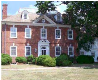
MT HARMON PLANTATION EARLEVILLE, MARYLAND SATURDAY AND SUNDAY, OCTOBER 23-24, 2010

Six miles north of downtown Philadelphia. Take I-76 to Exit 340: follow signs to Lincoln Drive ; from Lincoln turn right onto Johnson Street (3 rd Light); left onto Germantown Ave (4 th light); right onto Cliveden Street. Twenty five minutes from PA Turnpike, exit 25 on Germantown Pike.